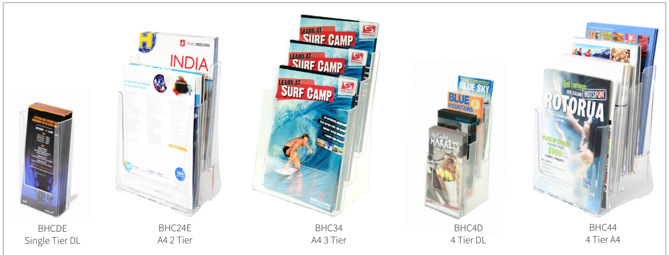
BHCDE Single Tier DL