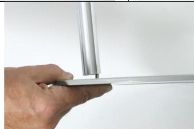
2. Screw brochure poles onto base with Allen key provided.