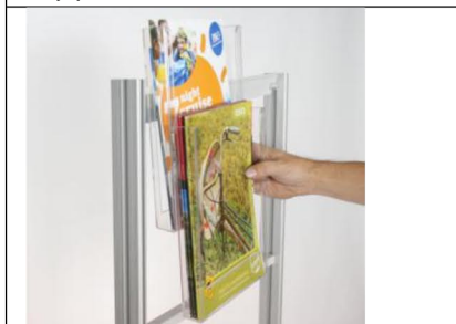
8. Clip second row of brochures to brochure holder