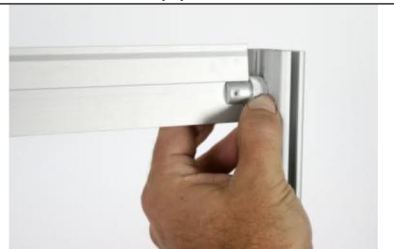
6. Insert Brochure Bar. Tighten by turning side of clamp