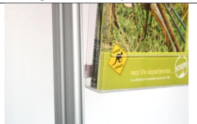
9. Readjust cross bar to be in the middle of last brochure row and tighten.