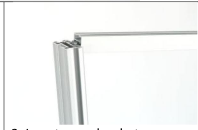
3. Insert cross bar between groove in brochure pole sides.