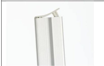
1. Remove caps off brochure poles.