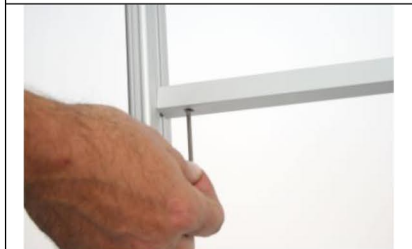
4. Tighten halfway with Allen key provided.