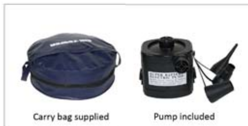
Carry bag supplied