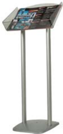
Product Code : BEF3 A3 Double Leg