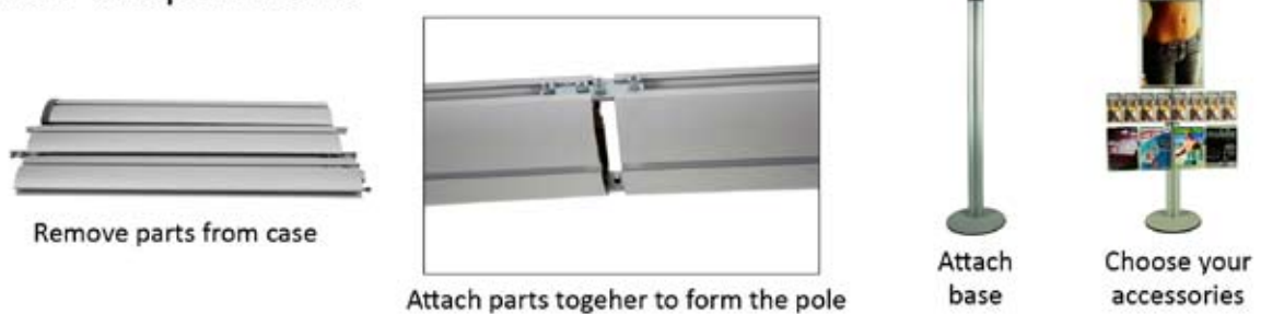
Remove parts from case