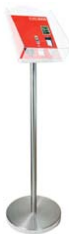
Product Code : BEF4 A4 Single Leg Stainless Steel