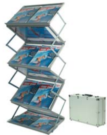
Product Code : BEE3 Expandable 6 Tray A3