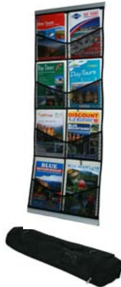
Product Code : BEFF3 Foldable A4 Mesh With Carry Bag