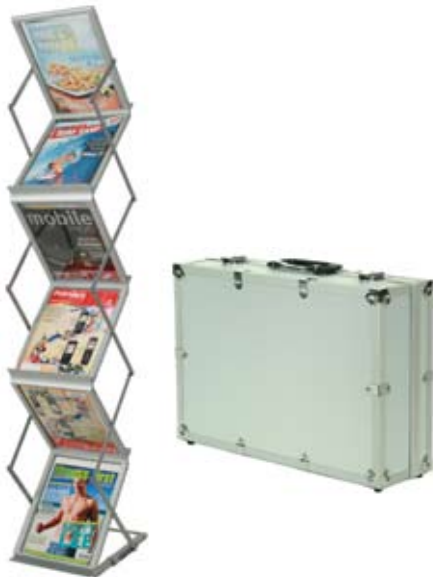
Product Code : BEE4 Expandable A4 With Case